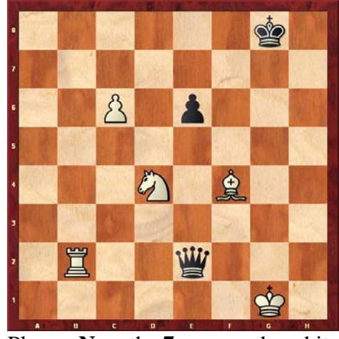
Diagram 5 – White to Move

Place a N on the 7 squares the white Knight can move to this turn