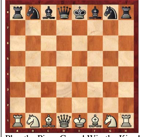
Diagram 6 – White to Move

Play the Piece Game! Win the King! Place chips at a3 h3 a6 h6