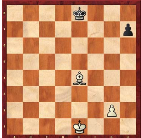
Diagram 1 – White to Move

Place a B on the 11 squares the white Bishop can move to this turn