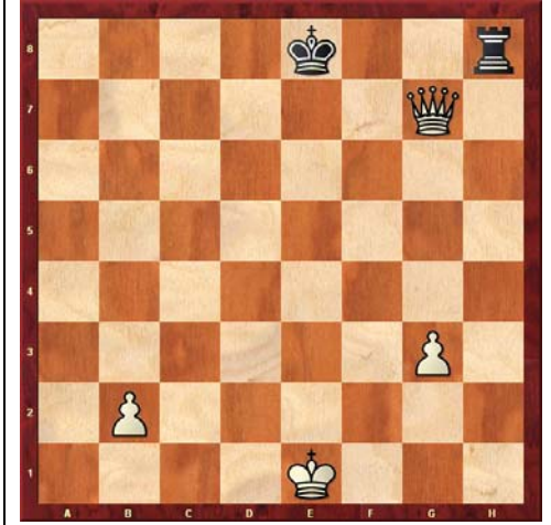
Diagram 3 – White to Move

Place a Q on the 18 squares the white Queen can move to this turn