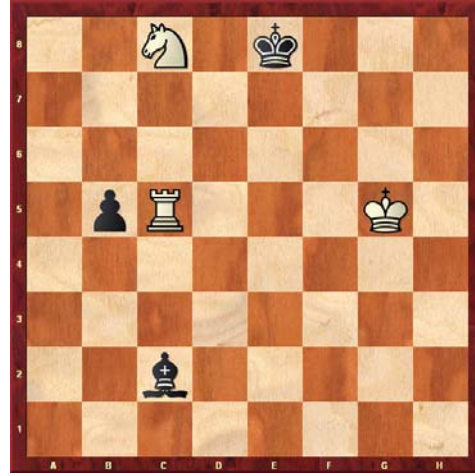
Diagram 2 – White to Move

Place a R on the 9 squares the white Rook can move to this turn